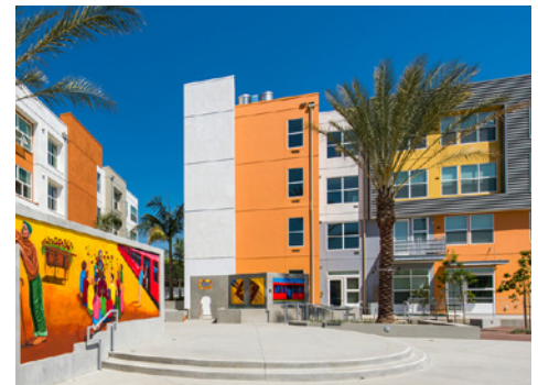
COMM 22, SAN DIEGO CA