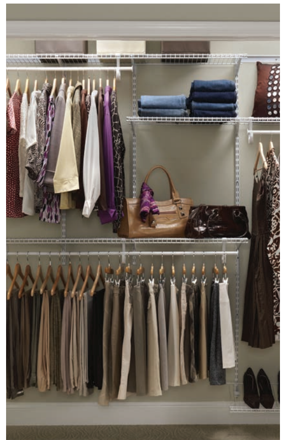
SHELFTRACK SUPERSLIDE IN WHITE